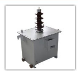
HV, Primary - Secondary current injectors