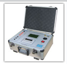
Transformer Turn Ratio Tester