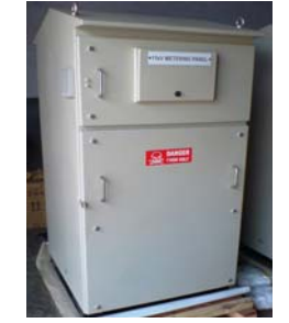
HT Metering Panels