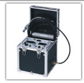
DC High Voltage Testers