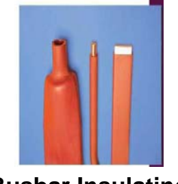
Busbar Insulating Sleeve