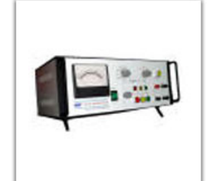
Million Meg Ohm Meter