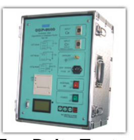
Tan Delta Tester