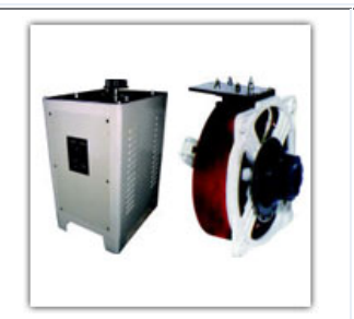
Cont.Variable Vol Auto Transformers