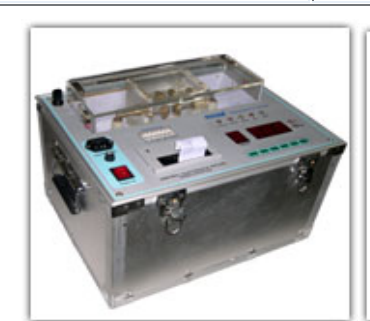
Insulating Oil Testers