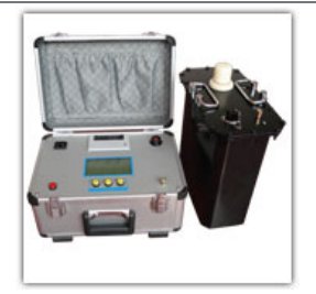
VLF AC Hipot Testers