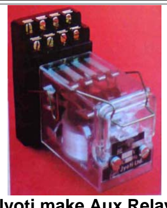
Jyoti make Aux Relay