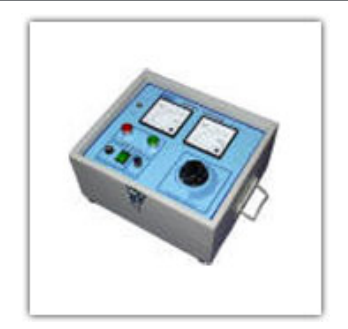
H. V. Testers 30 kV DC