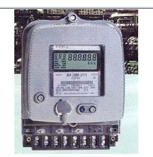
Secure/ABB/HPL make Energy Meters