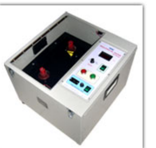
H. V. Testers 3 to 100 kV AC