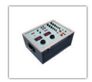
Relay Testing kit Sec. Current Injector