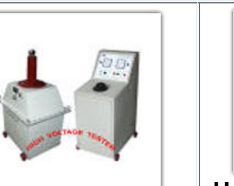
H.V.TESTERS (Hi pots) AC/DC (2 in 1)