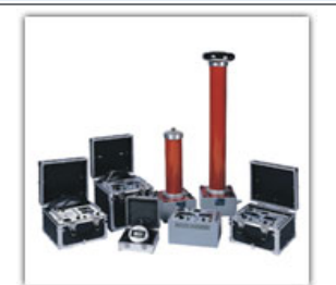
DC High Voltage Testers HIPOTS