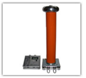
Universal Voltage Dividers