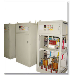
Soft Starters Panel