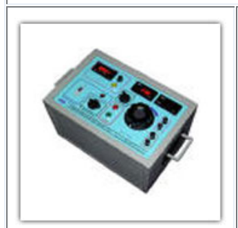
Primary Current Injector