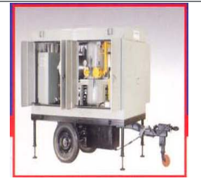
Transformer Oil Filtration Plant